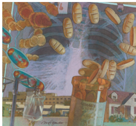
ILLUSTRATION BY MARK E. SCHULER

Patients with community-acquired pneumonia often present with cough, fever, chills, fatigue, dyspnea, rigors, and pleuritic chest pain. When a patient presents with suspected community-acquired pneumonia, the physician should first assess the need for hospitalization using a mortality prediction tool, such as the Pneumonia Severity Index, combined with clinical judgment. Consensus guidelines from several organizations recommend empiric therapy with macrolides, fluoroquinolones, or doxycycline. Patients who are hospitalized should be switched from parenteral antibiotics to oral antibiotics after their symptoms improve, they are afebrile, and they are able to tolerate oral medications. Clinical pathways are important tools to improve care and maximize cost-effectiveness in hospitalized patients. ( Am Fam Physician 2006;73:442-50. Copyright © 2006 American Academy of Family Physicians.)